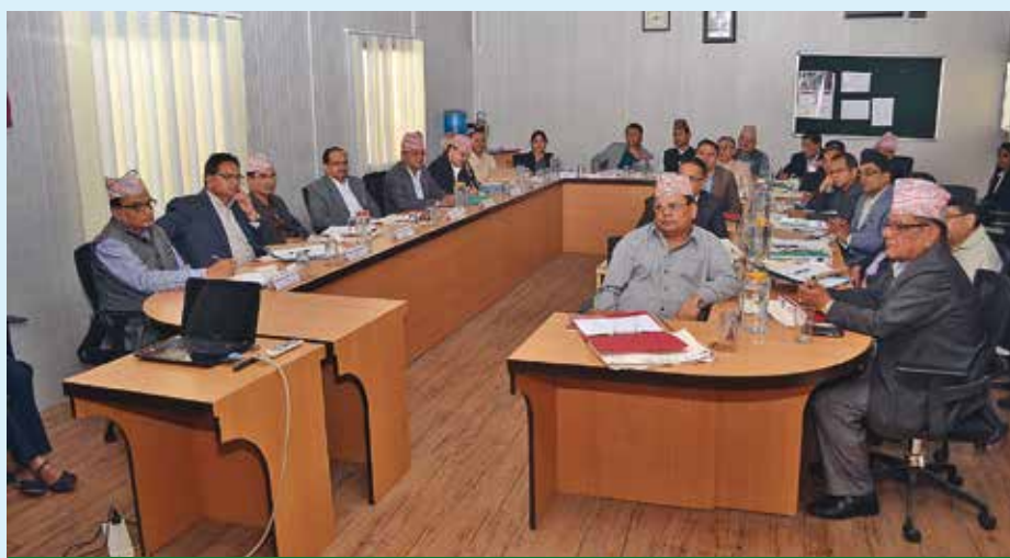
Training in progress

Judges attended the program. The program was supported by Nepal Rastra Bank (NRB).