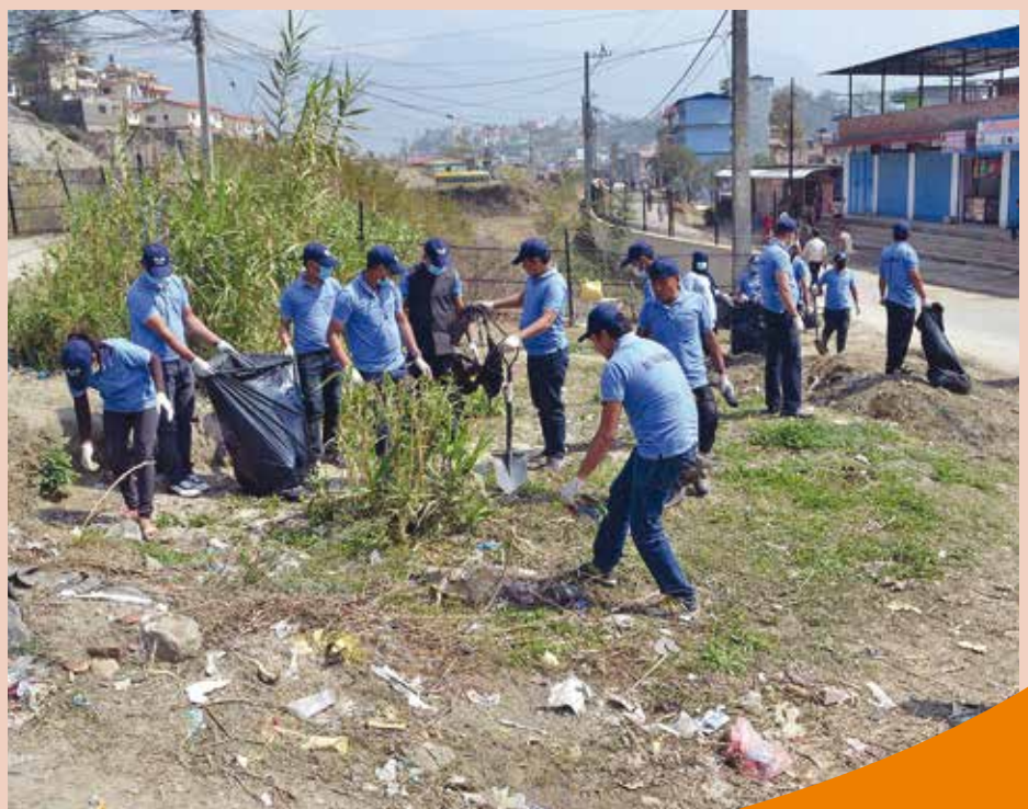
Keep the surroundings clean: NJA Team on Annual Day