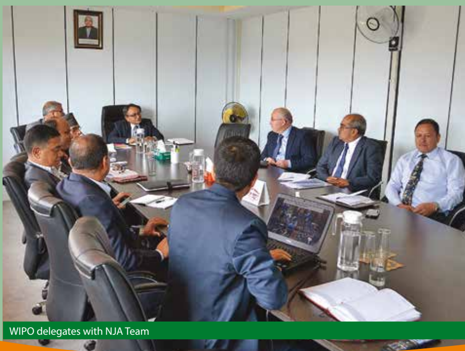
WIPO delegates with NJA Team

project could be taken forward between NJA-Nepal and the WIPO.