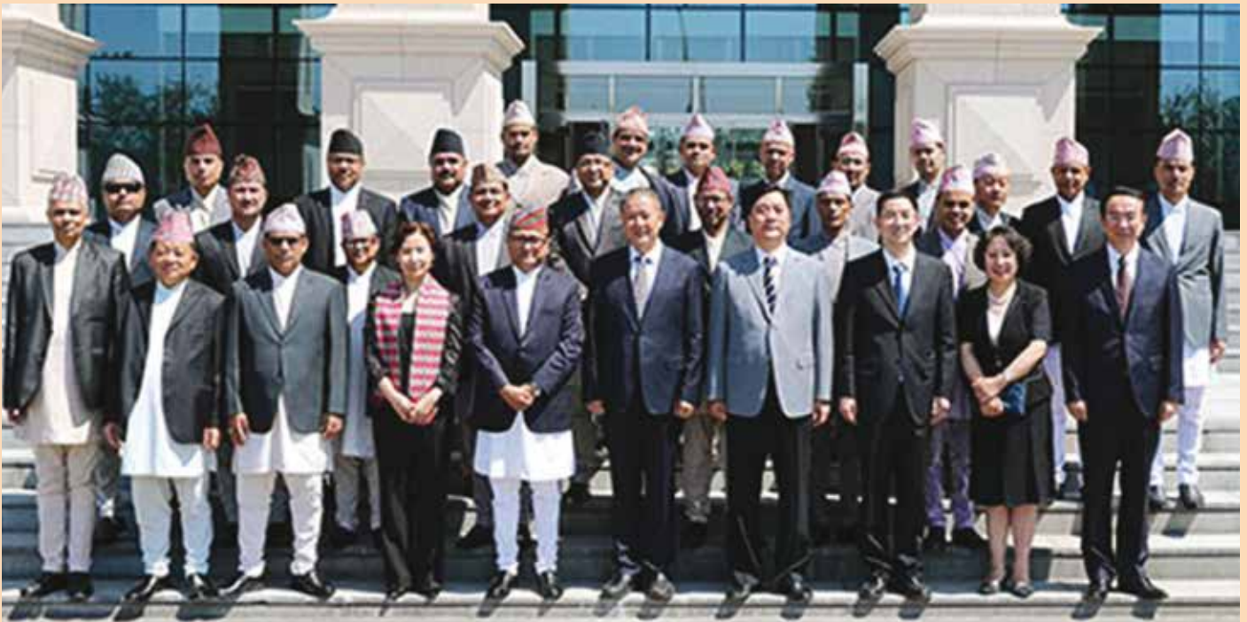
Nepali delegates with Chinese counter parts

extended sincere thanks on behalf of NJA-Nepal and Nepali delegation for their cooperation and support. The seminar was a part of the MOU signed between NJA-Nepal and Chinese delegation in Nepal during the visit of Chinese delegation to Kathmandu in April 2017.