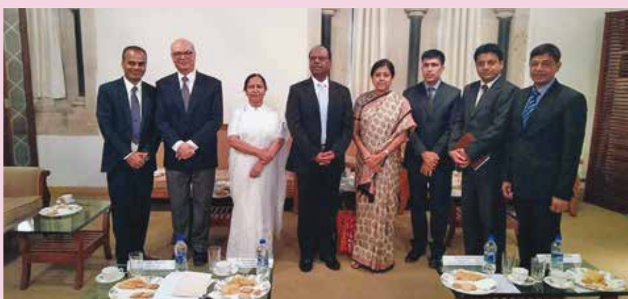
Nepali delegates with Justices of High Court of Bombay

team had meetings with the members of MJA and Hon'ble Justices of Bombay High Court where they also discussed about Nepali judicial system as well. The team also visited the Thane District Court where they were informed regarding the Case Information System (CIS), National Judicial Data Grid (NJDG) and the trial process at district level.