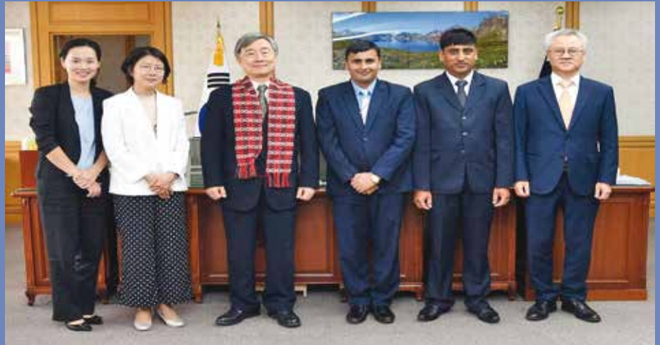
NJA interns with President of JRTI

building internship program from May 29 th to June 26 th , 2017 at Judicial Research and Training Institute (JRTI), Korea. During the program, they also participated in the two weeks global training program, etc.