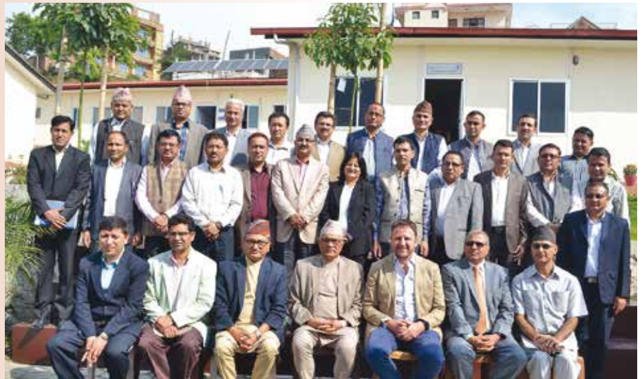
Rt. Hon'ble Chief Justice Gopal Parajuli and Hon'ble Keshari Raj Pandit with participants at NJA-Nepal Manamaiju

Dhankuta from June 4 to 5, 2017. judges in both of the programs Number of participating district was 22 each.