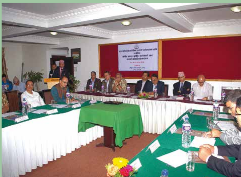
Academic Director delivering welcome speech