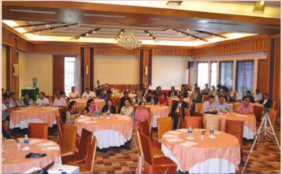
The Session on Mediation in Progress