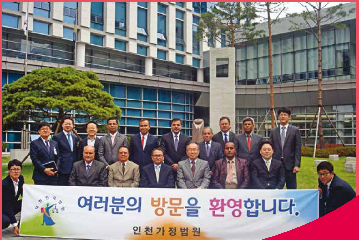
NJA delegates with Korean counterparts