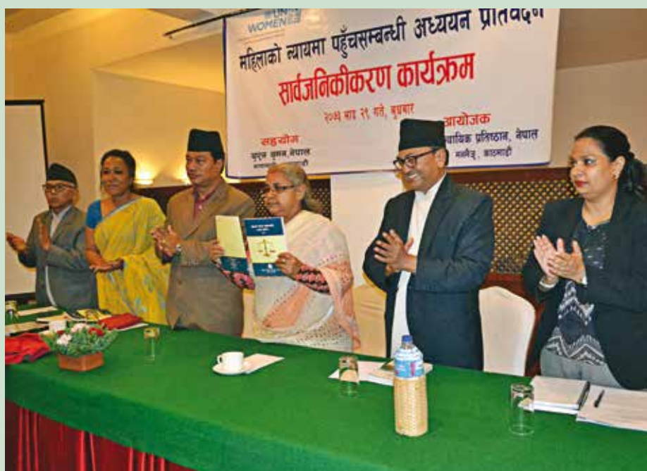
Rt. Hon'ble CJ Sushila Karki launching the Report on Women's Access to Justice