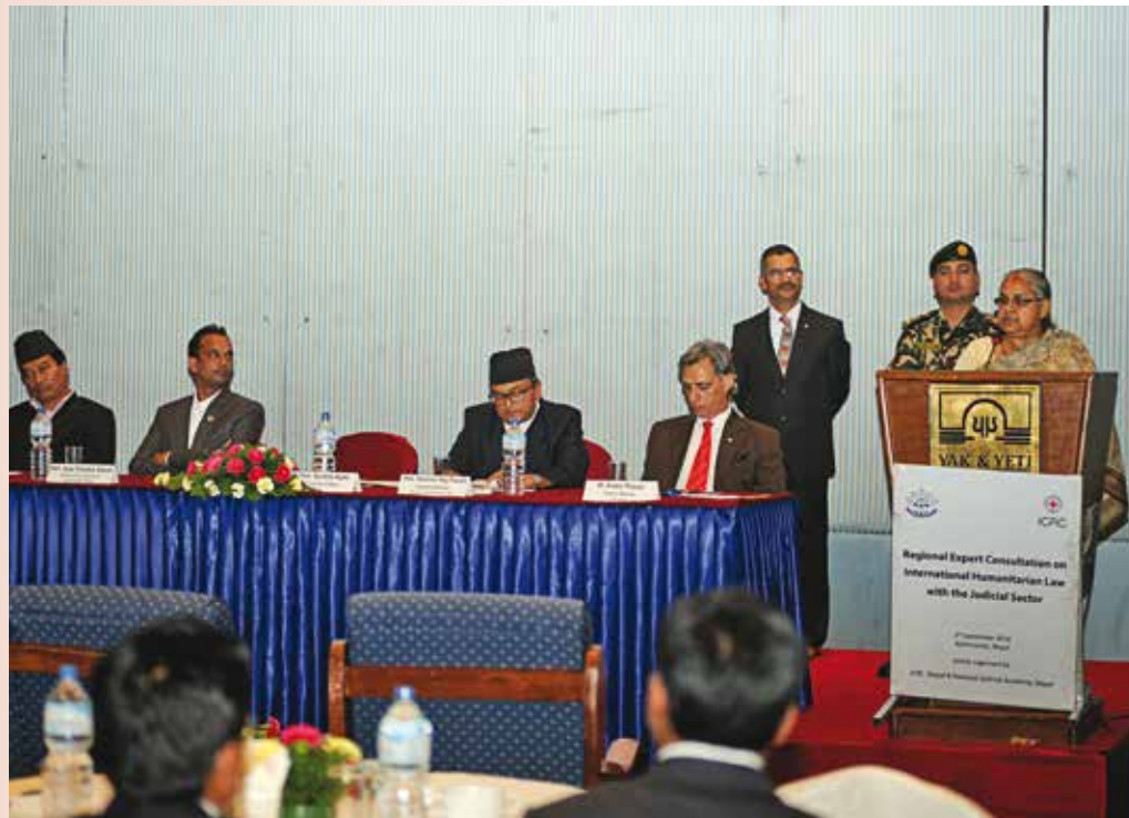
Rt. Hon'ble CJ Sushila Karki addressing the concluding session of Regional Expert Consultation on IHL