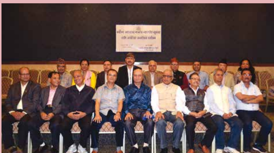
A group photograph of Hon'ble Supreme Court Justices during the Interaction Program

included description of different styles of judgment writings including comparative perspective. The presentation was followed by lively discussions.